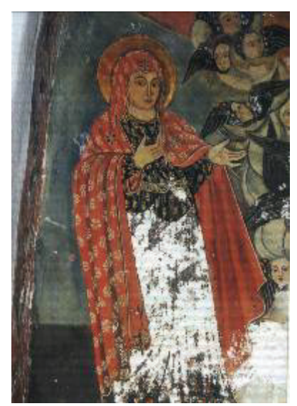
The fresco of the Virgin Mary to the right of the Pantocrator

To his right, stands the Virgin Mary with a golden halo around her head and her arms raised open to her son the king of glory; her right hand to her heart. The artist was keen to clearly depict the three stars in the form of buds on the Virgin Mary's head and shoulders, as a sign of her virginity before, during, and after delivery.