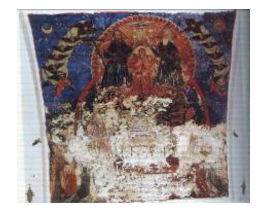
The coronation of the Virgin Mary

There are no windows in the structure due to the difficulty of digging them in rock; its vault is composed of three apses crowned with several frescos, most important of which is the one representing the coronation of the Virgin Mary, found in the northern side of the church above the baptism basin.